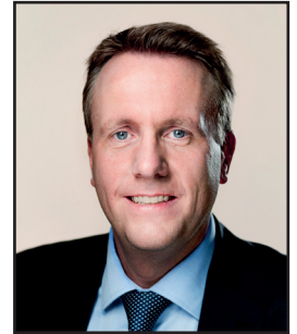
Morten Bødskov, Chairman.